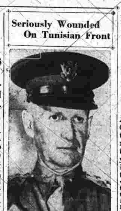
Lieut. Gen. Lesley J. McNair was seriously wounded last Friday in North Africa while on an inspection tour in that area.

Japan's Militarists Ambition Seen to Conquer United States.